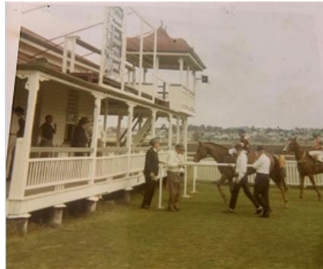
Flood January 2011

Missing from the Flood Gauge is the May 2022 level of 7.5m, which destroyed our sand training track.