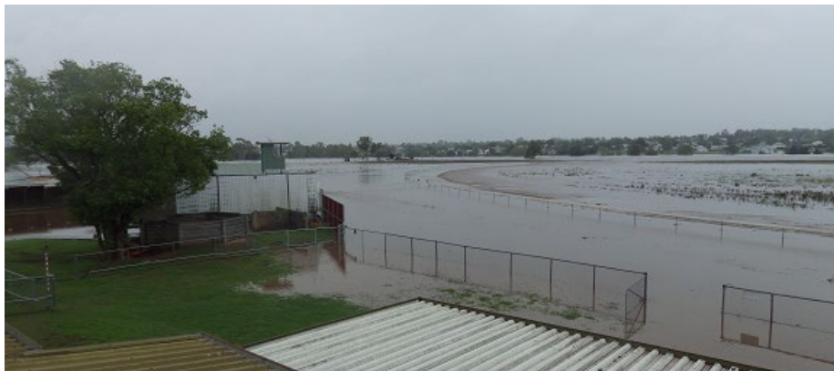
Flood May 2022